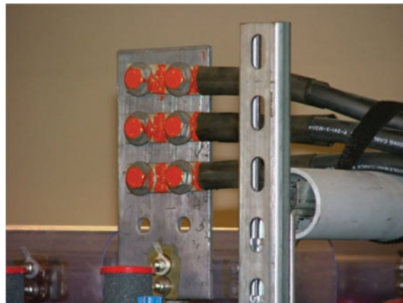
With proper conditions, including direct access and normal loads, problems like this high resistance connector are often easy to locate.